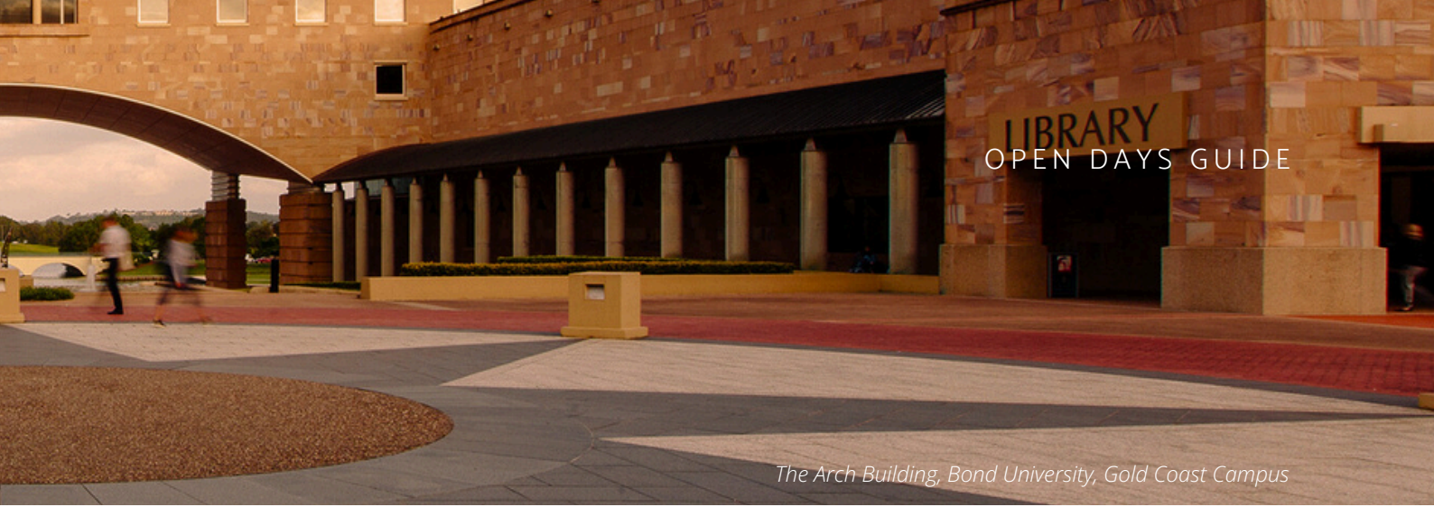
The Arch Building, Bond University, Gold Coast Campus