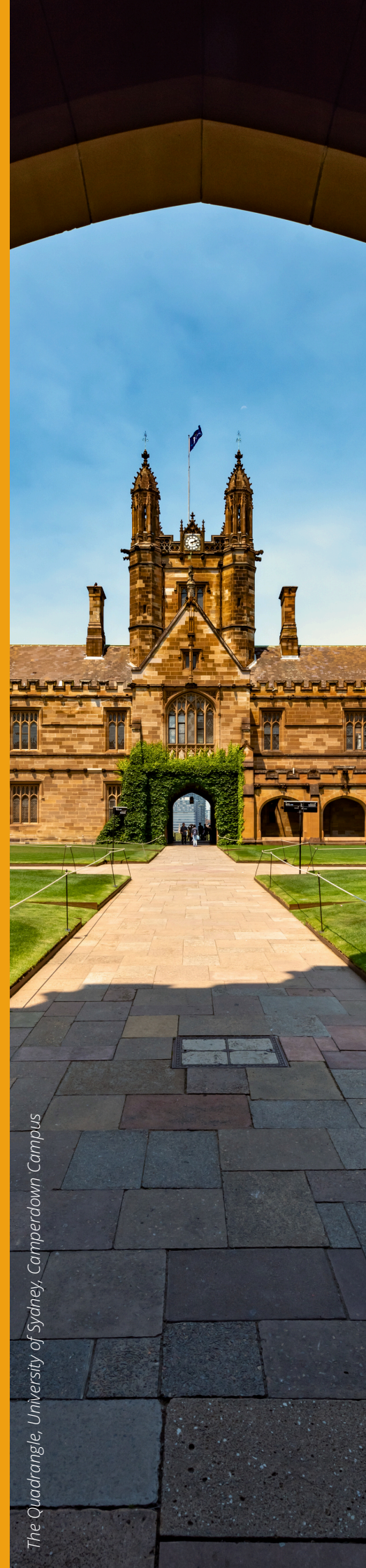
The Quadrangle, University of Sydney, Camperdown Campus