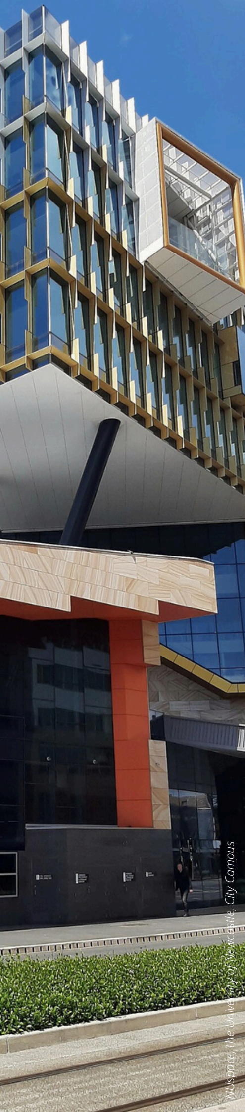
Uospace, the University of Newcastle, City Campus