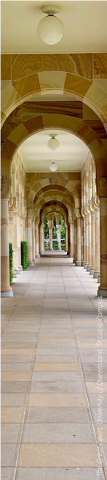
The Great Court, University of Queensland, St Lucia Campus

Careers advisors, teachers, and other school staff are also welcome at open days. They're a great way to find information to pass on to curious students who might not be able to make it, or even make connections between your school and the university.