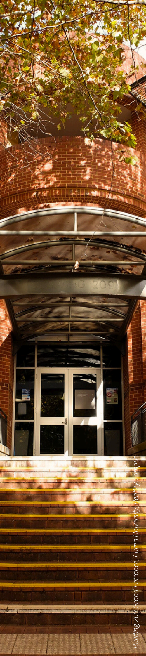
Building 209 Grand Entrance, Curtin University, Bentley Campus