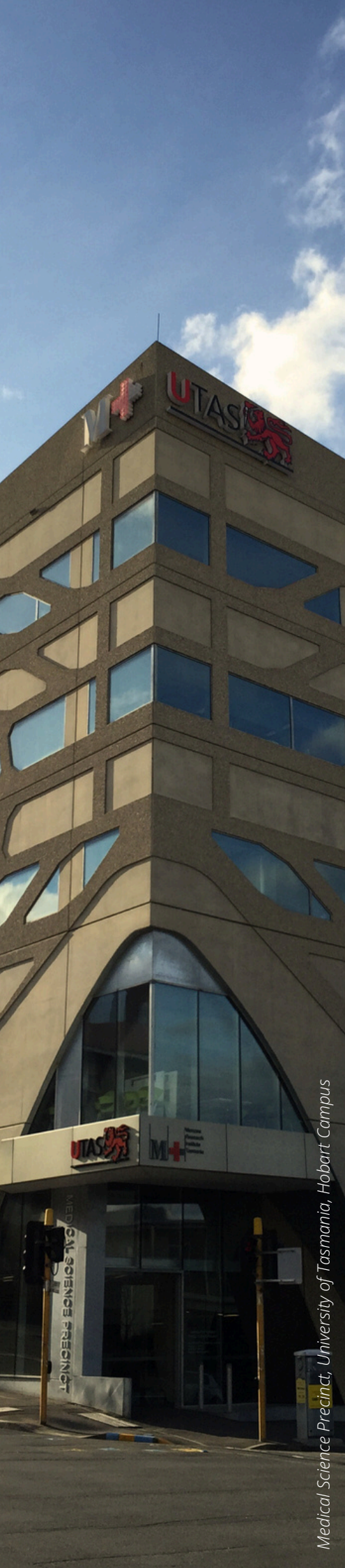
Medical Science Precinct, University of Tasmania, Hobart Campus