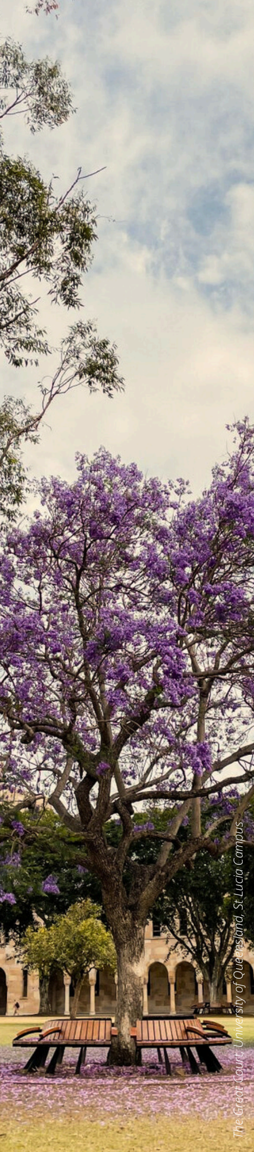
The Great Court, University of Queensland, St Lucia Campus