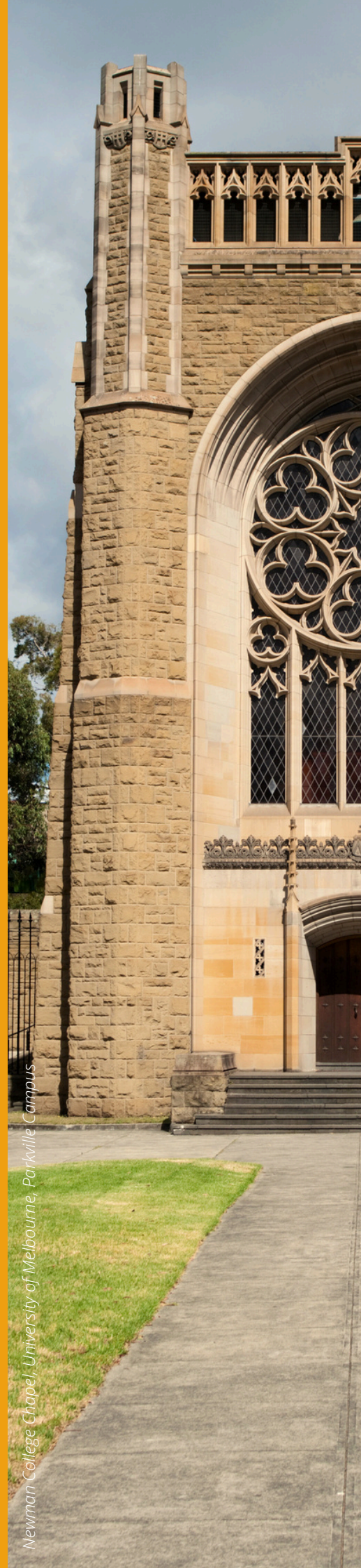
Newman College Chapel, University of Melbourne, Parkville Campus

The events in this guide may be subject to change at any time. In our experience, universities may choose to change dates, locations, and delivery modes and you should always check directly with the university for the latest information.